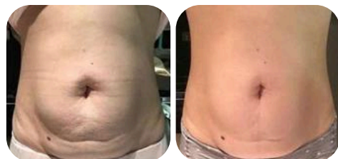
Results after 1 session* of INDIBA®