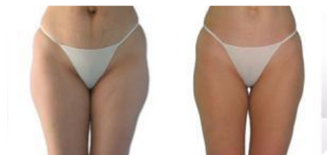
Results after 15 sessions* of LPG