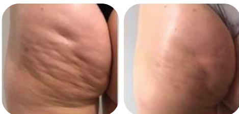
Results after 7 sessions* of INDIBA®