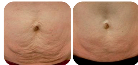
Results after 15 sessions* of LPG